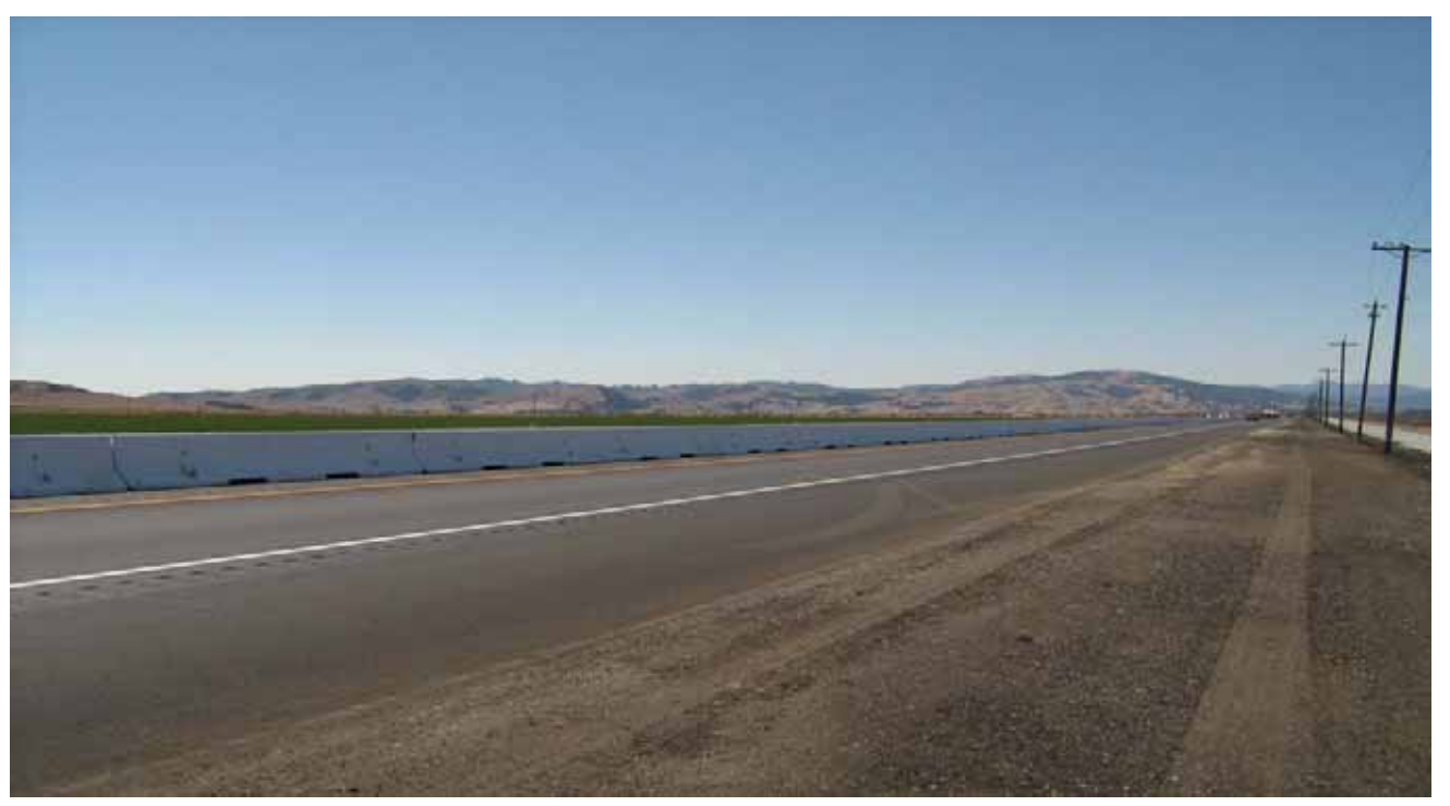
Hwy 25 Northbound with K Rail and Final Stripe (Finished Product)