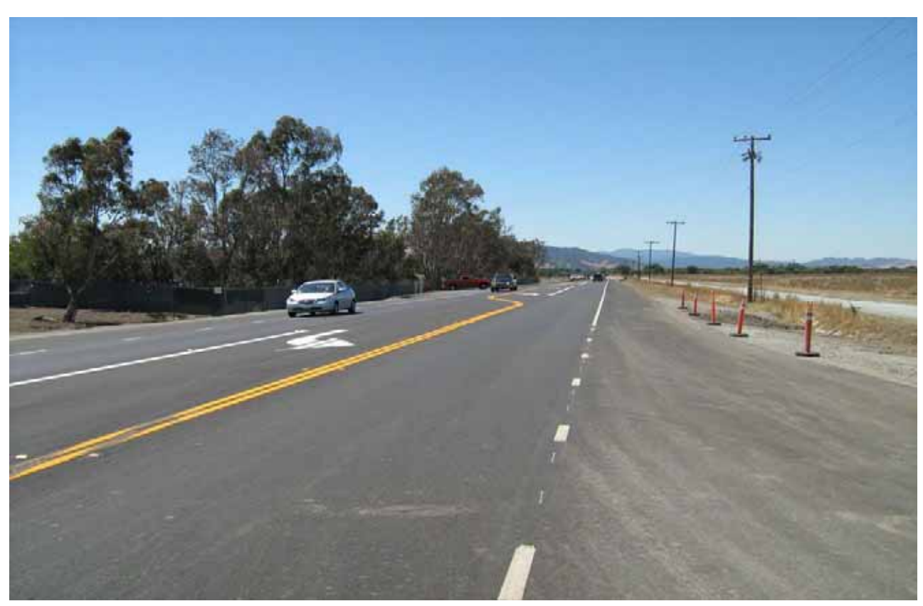
Turn Lanes for Tri Cal