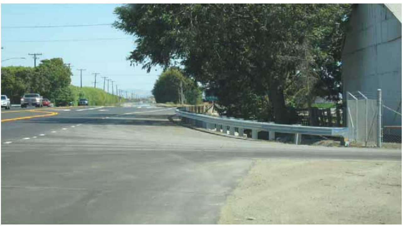
Hudner Ln with new Metal Beam Guardrail