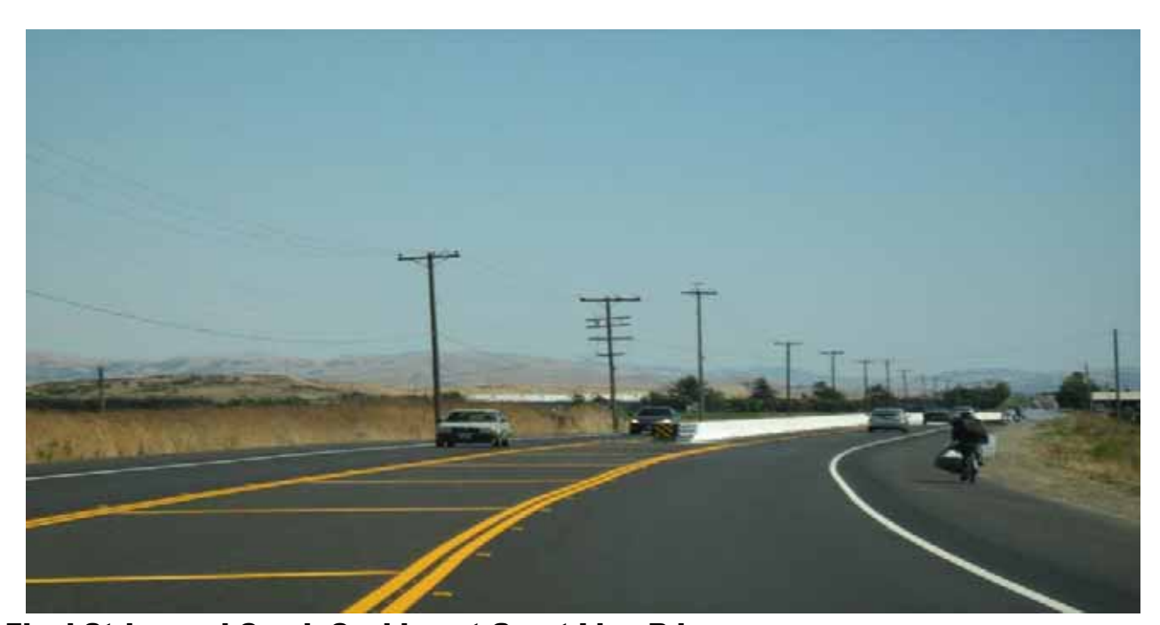
Final Stripe and Crash Cushion at Grant Line Rd.