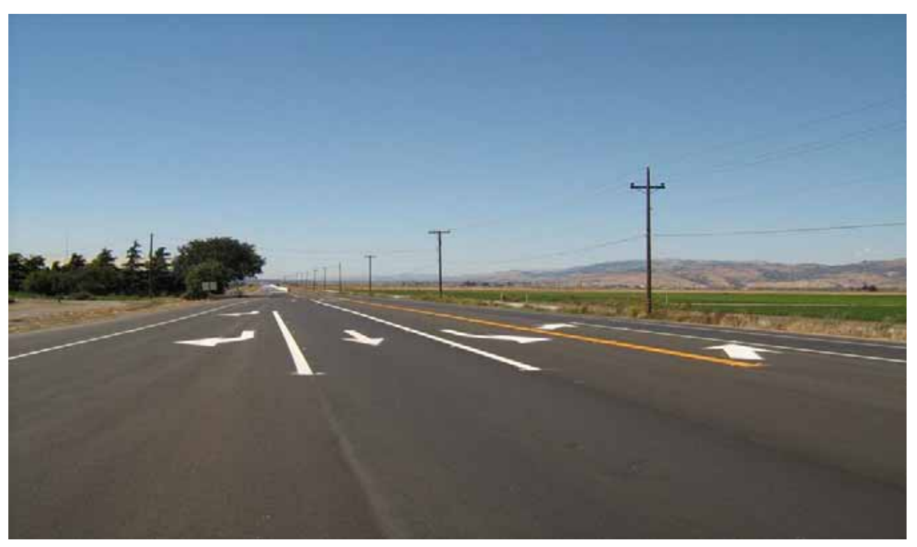
Intersection at Hudner Ln new Turn Lanes and Acceleration Lane